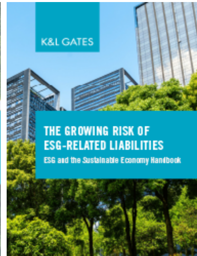
THE GROWING RISK OF ESG- RELATED LIABILITIES