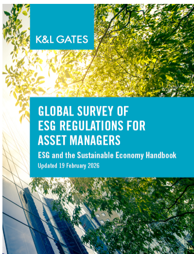
GLOBAL SURVEY OF ESG REGULATIONS FOR ASSET MANAGERS